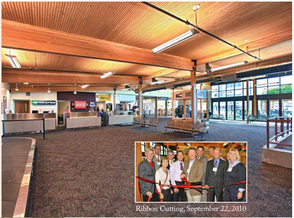
Ribbon Cutting, September 22, 2010

The success of Horizon Air scheduled airline service gave a clear indication that the 1960s era terminal lacked space for increased passenger traffic and security needs. In 2009, STS received $1,685,000 in American Recovery and Reinvestment Act funds to remodel and expand the terminal. The budget for the project totalled approximately $2.4 million; the difference between the grant and total project cost was funded by the Airport with Passenger Facility Charge (PFC) funds. In September 2010, County officials and guests celebrated the completion of the remodel. Improvements to the terminal include an additional 5,000 square feet, a new security screening room, two new restrooms, additional ticketing and rental car counters and more space overall for passenger comfort.